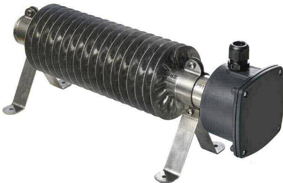
WD-H RVS (excl. thermostat)