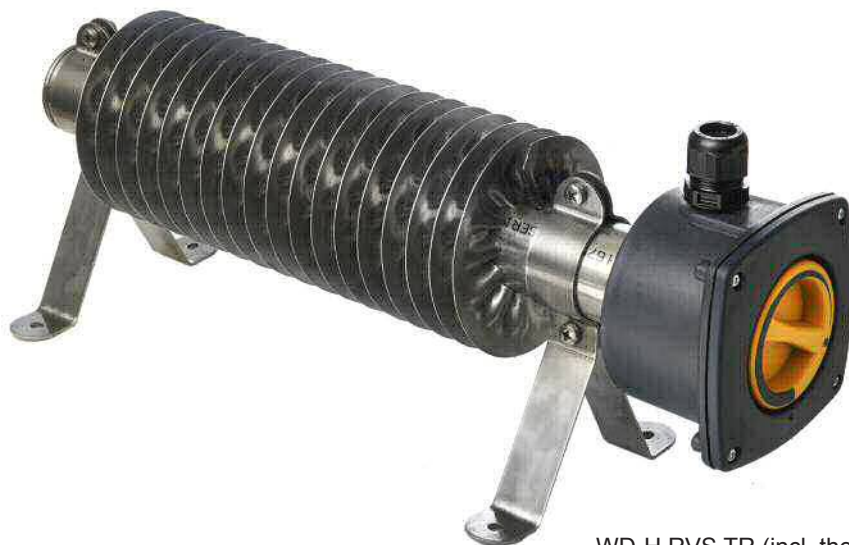
WD-H RVS TR (incl. thermostat)

Type TR is supplied with built-up thermostat, adjustable between +5°C to +30°C. Type ST is supplied with built-up step-controller: 1/3, 1/2 and full power.